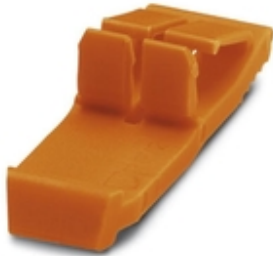
Latching, length: 29.8 mm, width: 10 mm, number of positions: 2, color: orange

Please be informed that the data shown in this PDF Document is generated from our Online Catalog. Please find the complete data in the user's documentation. Our General Terms of Use for Downloads are valid ( http://phoenixcontact.com/download )